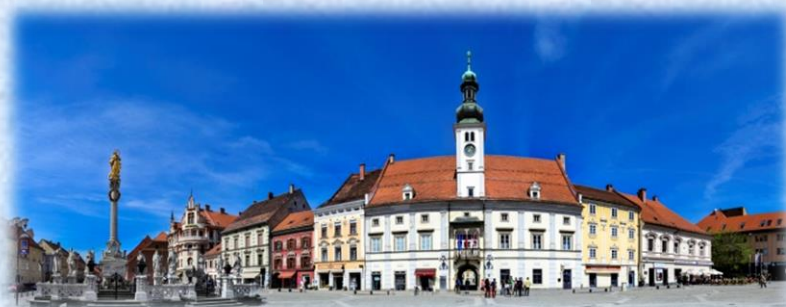
Glavni trg , Maribor, Photo: Jure Kralj

Pohorje prides itself as being the only magmatic metamorphic mountain chain in Slovenia and appropriately so are its ecological characteristics, relief formation, waters and landscape characteristics. On an impermeable stone foundation it formed in a characteristic relief ridge and heaped peaks and the densest system of surface water in Slovenia. The complex geographical region of Pohorje is diverse with natural heritage. Its exceptionalness and distinctiveness is shown in flat land and peat moors and small lakes, canes in marble and tonalite, tallest Slovene pine trees (Sgermov's pine tree), remains the primeval forest Šumik, site of magmatic rock (tonalite, chislakite and marble).