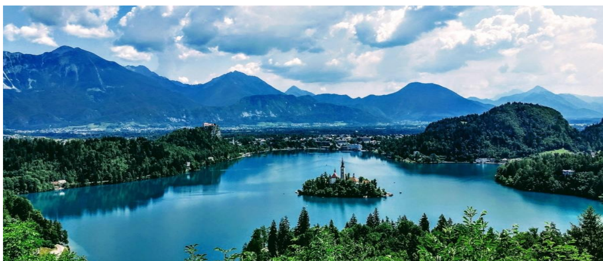
*Lake Bled, Slovenia

Slovenia has historically been the crossroads of Slavic, Germanic, and Romance languages and cultures. Although the population is not homogeneous, Slovenes comprise the majority. The South Slavic language Slovene is the official language throughout the country. Slovenia is a largely secularized country, but Catholicism and Lutheranism have significantly influenced its culture and identity. The economy of Slovenia is small, open and export-oriented and is thus strongly influenced by the conditions of its exporting partners' economies. It has been severely hurt by the Eurozone crisis which started in 2009. The main economic field is services, followed by industry and construction.